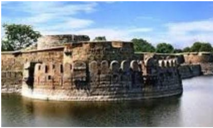
ST. JOHN'S CHURCH